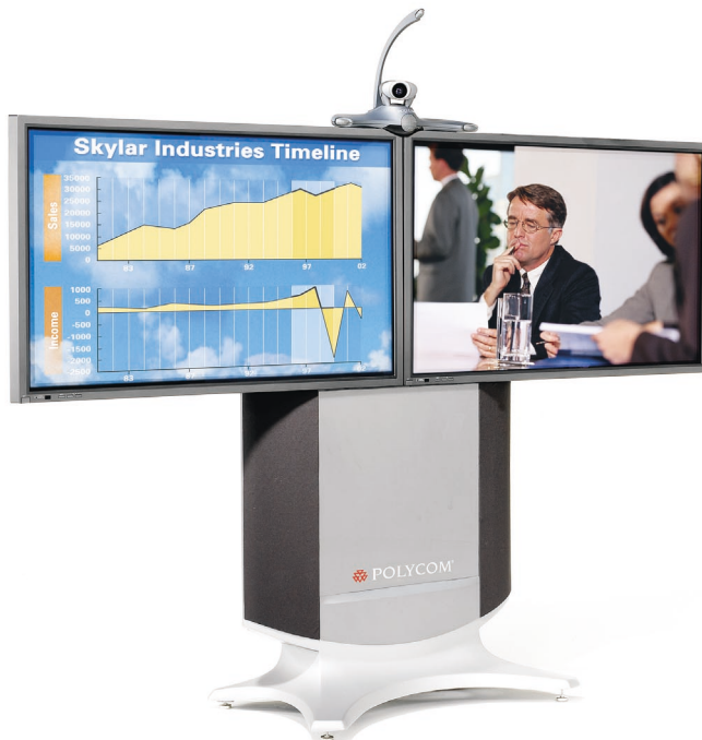
Executive Collection Floor System with Dual Displays